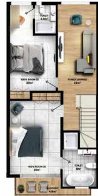
SECOND FLOOR LAYOUT